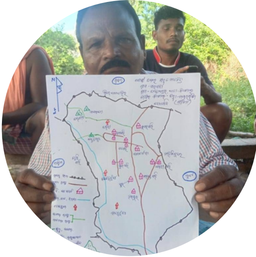
FRA /CFR claim making process