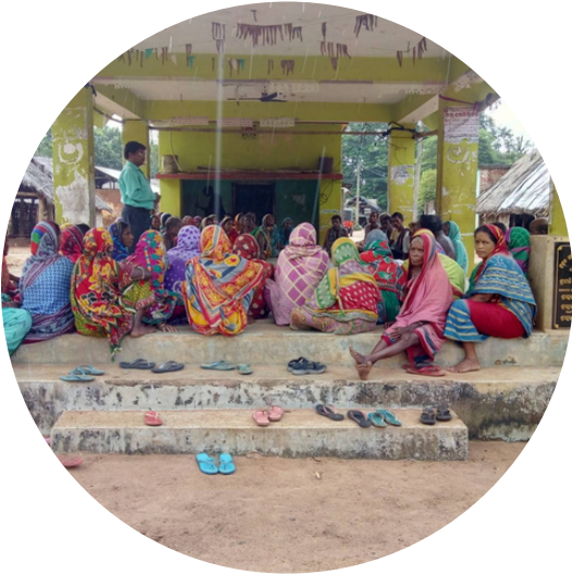
Traditional boundary mapping